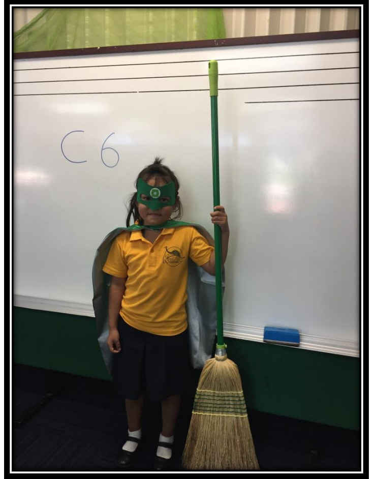
Above: Students from C5 and C6, the first winners of the Green Lantern Award for 2017. Below: Students from B6 helping keep our school and community clean.